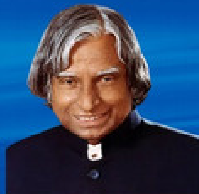
INSPIRED BY BHARAT RATNA DR. A.P.J ABDUL KALAM 11TH PRESIDENT OF INDIA